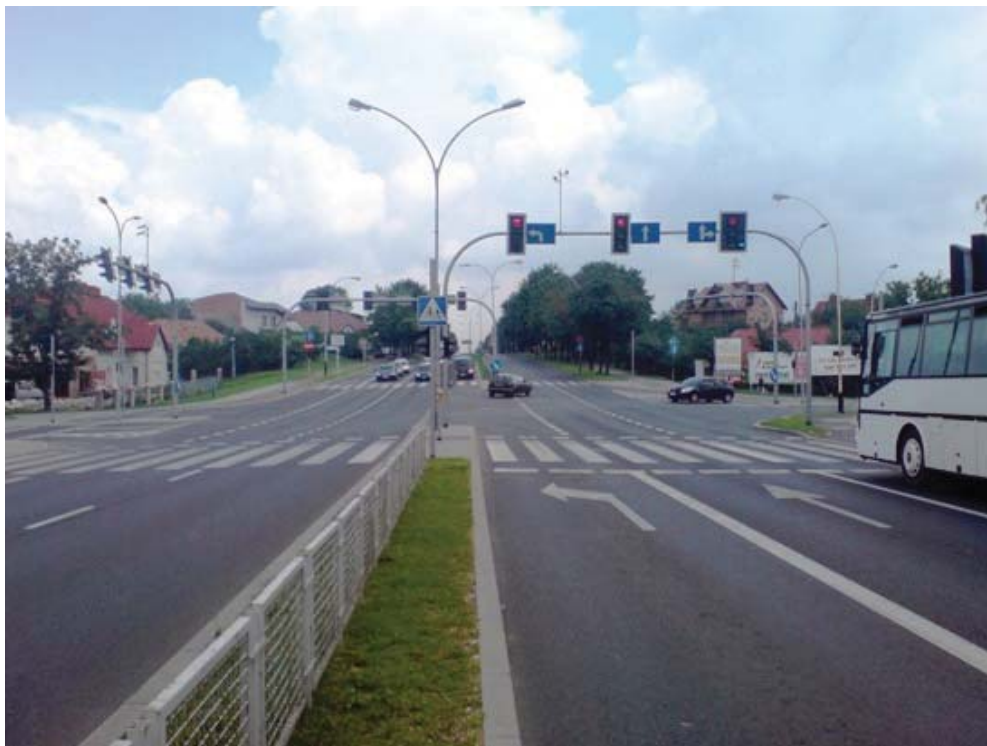
Fig. 4. A photograph of the crossroads of Lubelska – Staromiejska – Trembeckiego Streets after the rebuilding