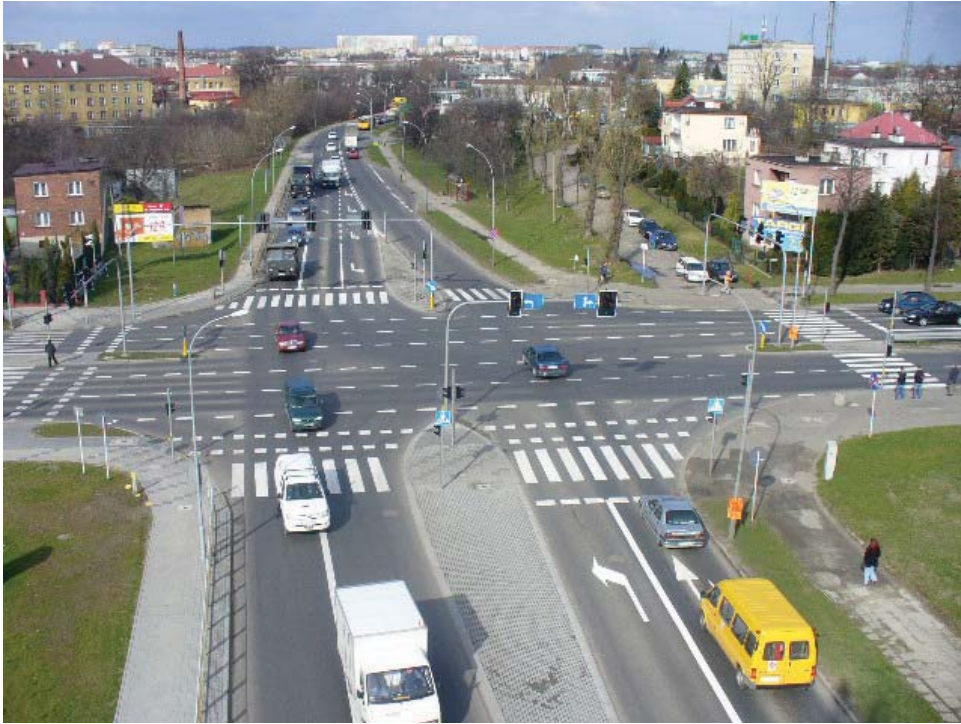
Fig. 3. A photograph of the crossroads of Lubelska – Maczka – Wyzwolenia Streets after the rebuilding